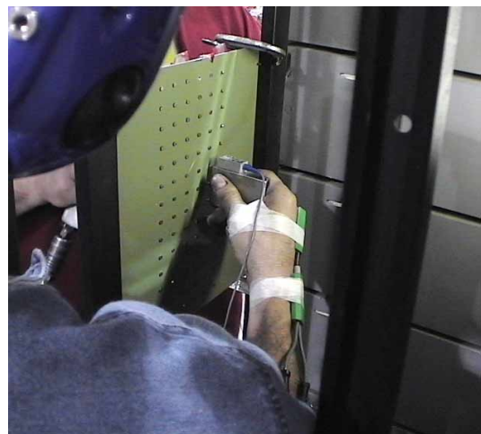
Figure 2. Accelerometer attached to the bucking bar during the experimental task.

A datalogger (Biometrics DataLOG II) was used to collect the vibration and electromyography data during the experimental trials. Bucking bar vibration was collected using a 10g tri-axial accelerometer (Biometrics S2-10G-MF Series 2), and right hand/wrist flexor and extensor muscle activity was collected from a bipolar EMG sensors (Biometrics SX230). The accelerometer voltages were collected at 5000 Hz, whereas the EMG voltages were collected simultaneously at 1000 Hz by the datalogger.