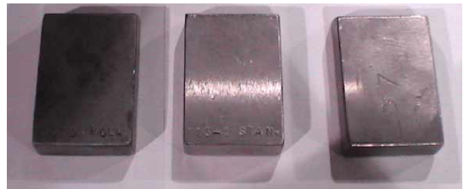
Figure 1. Bucking bars used for experimental tasks. The left bucking bar is made of cold rolled steel, the middle bucking bar is made of stainless steel, and the right bucking bar is made of >90% tungsten. The 90% tungsten (not shown) was the same size as those shown in the figure.

tungsten bar weighed 807.2 g, and the >90% tungsten bar weighed 902.3 g. One employee using the same air hammer (size E2) drove the rivets for all subjects using the bucking bars. A square skin (approximately 12 inches by 12 inches) was fitted with six vertical rows of rivets, and was attached to a vertical metal frame to provide stability to the skin for the riveting and bucking task (Figure 2).